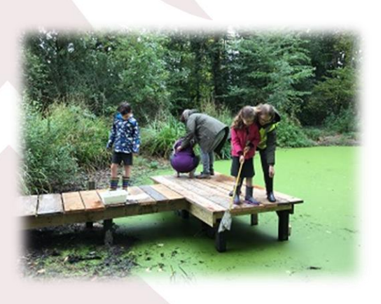
In our outdoor learning enrichment session, Years 3 and 5 used the new pontoon for observing dragonflies and pond-dipping for dragonfly larvae.