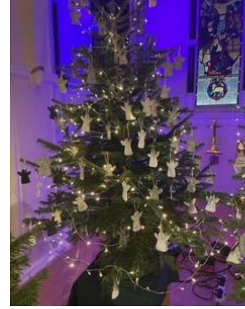
Foley Ro T 01372