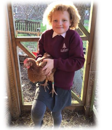
Arbrook – dark green (Lola)