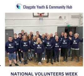
NATIONAL VOLUNTEERS WEEK